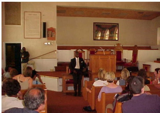
Figure 3: Rev. Shuttlesworth inside Historic Bethel Baptist Church with previous "Stony . . ." Institute participants.

Returning veterans who had fought for freedom in Europe sought those same freedoms for themselves and their families. Denied equal access and justice in the courts, they sought it in the streets in organized protest marches, sit-ins, pray-ins, and by applying economic pressure in the form of selective buying campaigns. Leaders in the