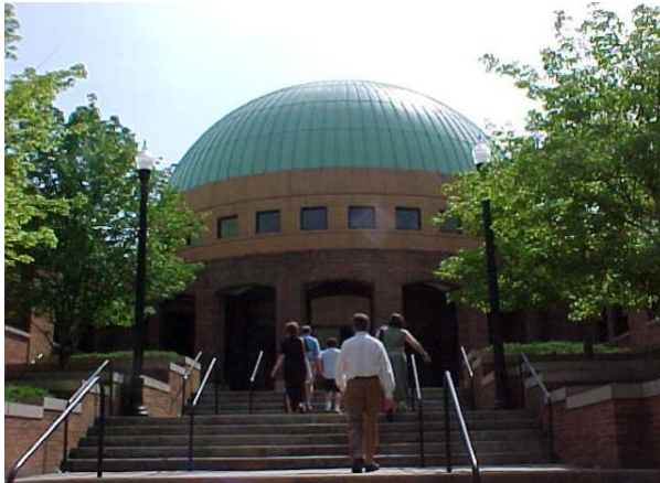
Figure 6: Front entrance of the Birmingham Civil Rights Institute.

From its inception, the founders recognized the universality of human conflict. After all, Dr. Martin L. King had been deeply influenced by the religious and ethnic conflicts in India, parts of Africa, and Eastern Europe earlier in the twentieth century. In time, these and other nations drew positive lessons from the American Civil Rights Movement.