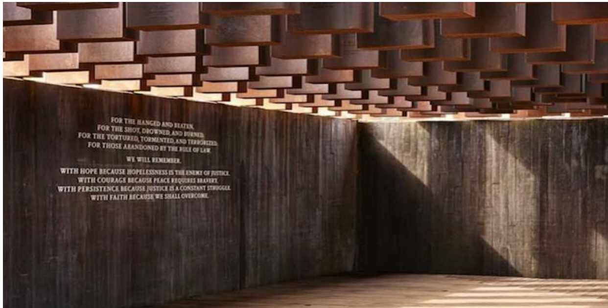
Figure 8: The Equal Justice Initiative Memorial, the “Hanging Memorial.”

Participants will visit Tuskegee , home of the first college for African Americans in Alabama. The college, established by Booker T. Washington, is well known for the agricultural revolution inspired by the work of Dr. George Washington Carver. This city is also home of The Tuskegee Airmen. We will tour the refurbished training site that prepared the men to serve in the Army Air Corp. Events in Tuskegee, as they relate to voting, caused the nation to enforce the “one man-one vote” principle as a result of Gomillion v Lightfoot . Our last stop in this landmark city will be the Tuskegee Multicultural Center where we will meet attorney Fred Gray and learn about his work as one of the leading civil rights attorneys in U. S. history.