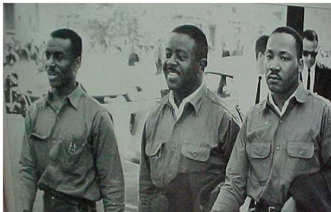
Figure 2: The "Big Three:" Rev. Fred L. Shuttlesworth, Dr. Martin Luther King, Jr., and Rev. Ralph Abernathy

Nearly wiped out by cholera and then by an economic depression in the late 1870s, the little boomtown found its resurgence in a natural abundance of coal, iron ore and limestone, all the ingredients necessary to make steel. Then, the steel making industry took off in a big way and so did Birmingham! Throughout the Great Depression, Birmingham used "Yankee" capital and an infusion of labor from European immigrants, planting the beginnings of the city's strongly diverse ethnic character.