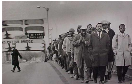
Figure 5: Rev. Hosea Williams and John Lewis lead protestors across the Edmund Pettus Bridge in Selma, Alabama on March 7, 1965.

“The Birmingham Civil Rights Institute founders set out to “focus on what happened in the past, to portray it realistically and interestingly, and to understand it in relationship to the present and future developments of human relations in Birmingham, the United States and the World.”