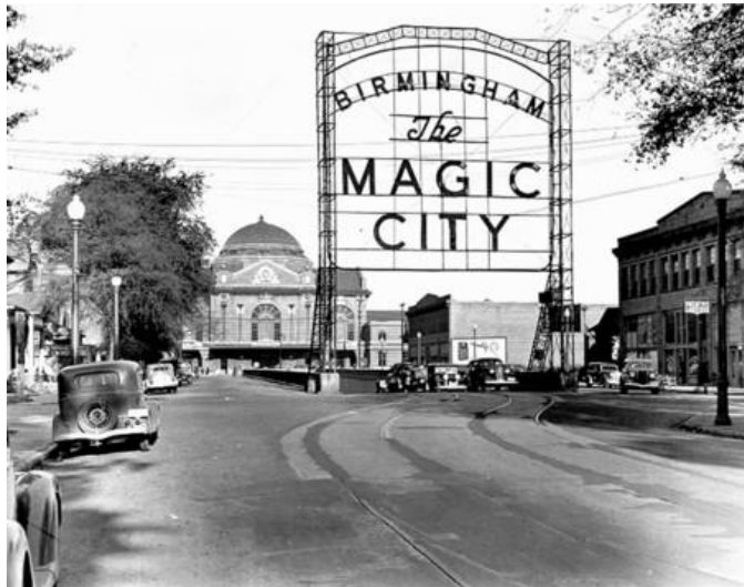
Figure 1: The Magic City sign was erected in 1926 and stood outside of the Terminal Train Station.

The meteoric rise of Birmingham from the place where two railroad lines intersected to a place that forever changed the social, cultural, political, economic, and judicial landscape of the United States of America, and inspired freedom struggles around the world is nothing short of phenomenal.